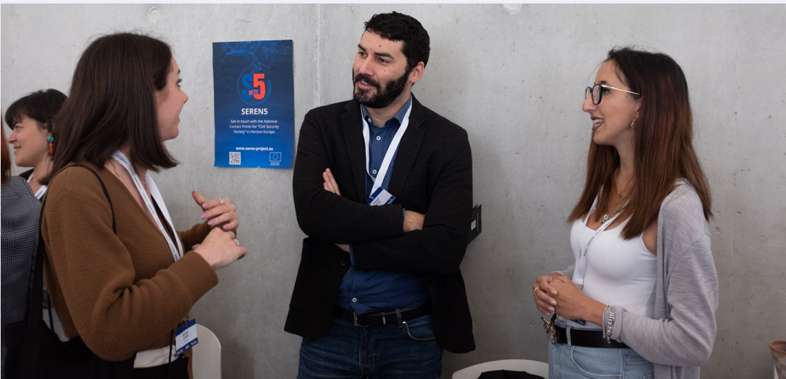
SERENS5 NCPs during networking discussion